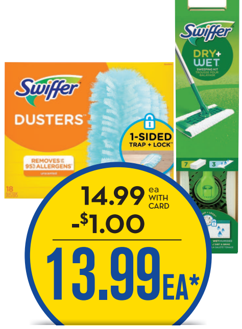
Swiffer 3.3X Kits and Refills selected 1-52 ct. varieties