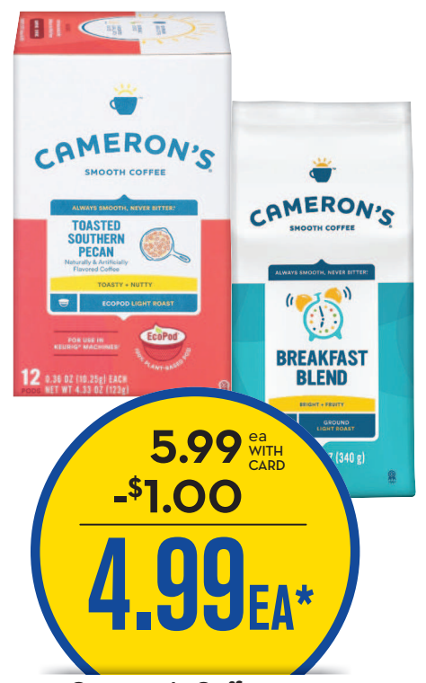
Cameron's Coffee selected 10-12 oz. bag or 12 ct. K-Cups varieties