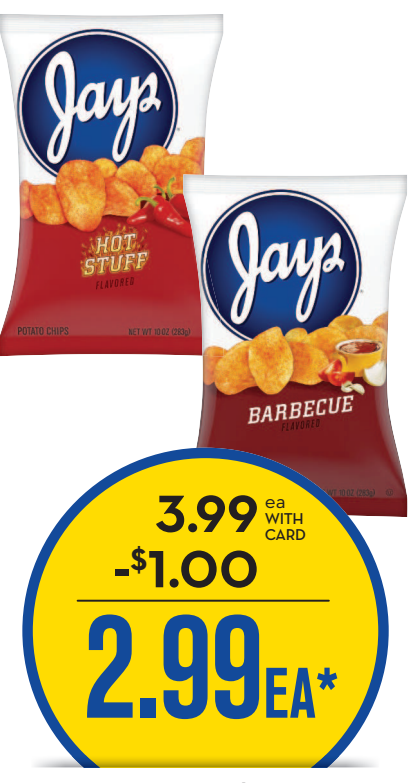
Jay's Potato Chips selected 10 oz. varieties