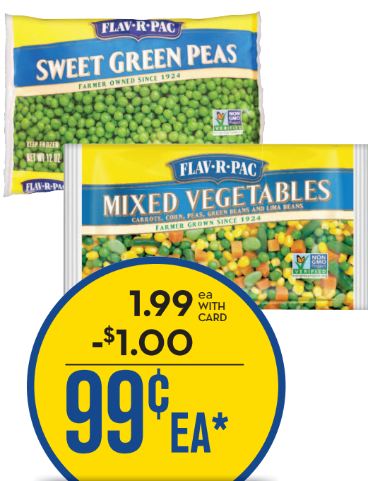
Flav-R-Pac Frozen Vegetables selected 12 oz. varieties