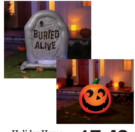
Holiday Home LED Halloween Inflatable