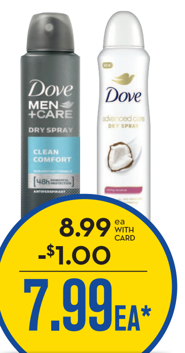
Dove Anti-Perspirant Spray selected 3.8 oz. varieties