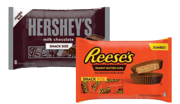
Hershey's Snack Size Candy