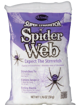
Super Stretch Spider Webbing selected 1.76 oz. varieties