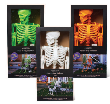
Holiday Home Pose-n-Stay Skeleton