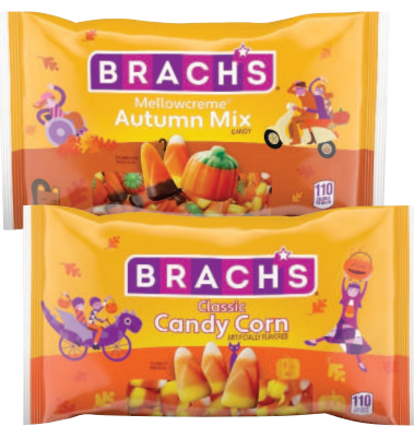
Brach's Candy Corn or Autumn Mix Candy WITH CARD