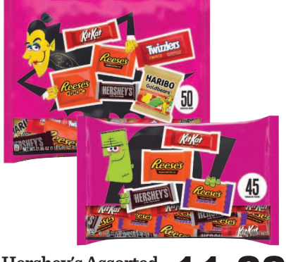
Hershey's Assorted Halloween Candy selected 35-85 ct. varieties