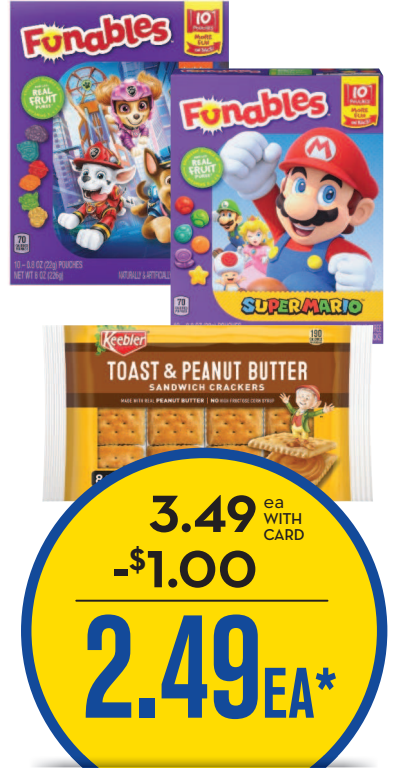
Keebler Sandwich Crackers or Funables Fruit Snacks selected 8 ct. or 10 ct. varieties