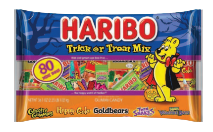
Haribo Trick or Treat Gummi Candy Mix