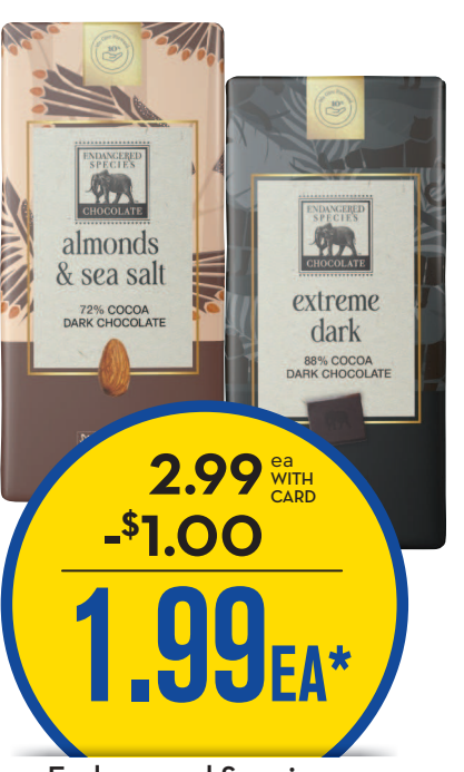
Endangered Species Chocolate Bars selected 3 oz. varieties