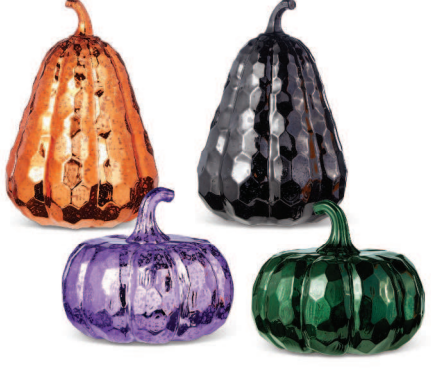
Holiday Home LED Plastic Pumpkin selected varieties