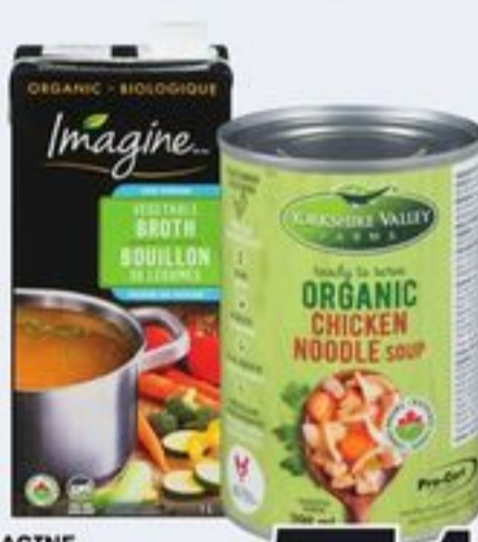
IMAGINE ORGANIC BROTH 1 L OR YORKSHIRE ORGANIC SOUP 398 ML SELECTED VARIETIES 20321614005_EA 21560109_EA