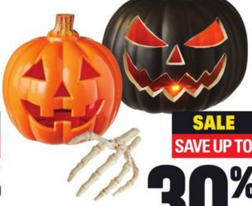
HALLOWEEN DÉCOR SELECTED VARIETIES 21576582_EA/21576480_EA/21176280_EA