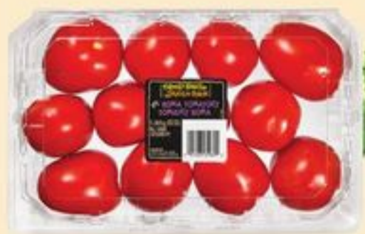
CANADA FARMER'S MARKET ™ ROMA TOMATOES PRODUCT OF CANADA 3 LB 20887458001_EA