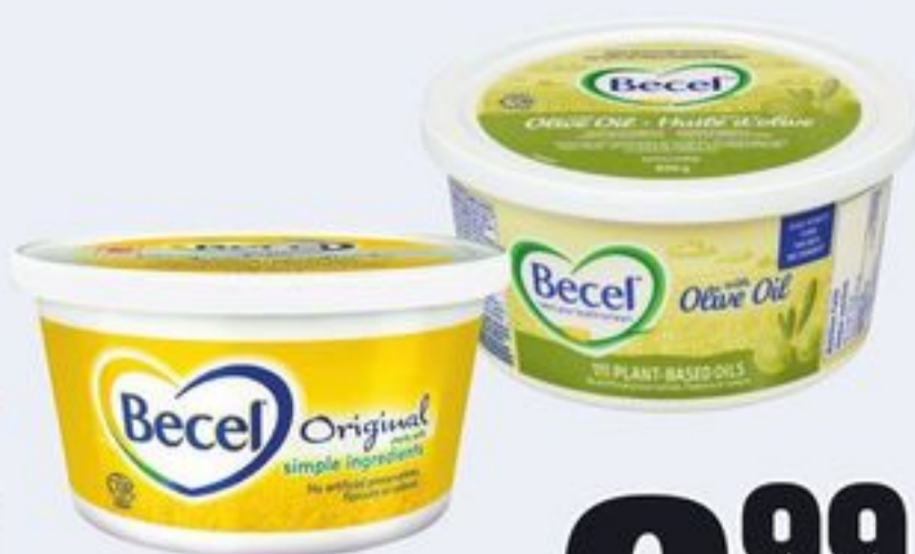
BECEL MARGARINE SELECTED VARIETIES 637/850 G 20297818002_EA/21279389_EA