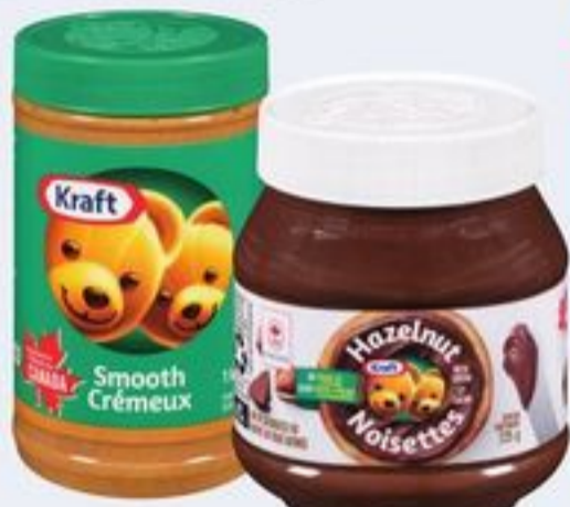
KRAFT PEANUT BUTTER 750 G-1 KG OR HAZELNUT SPREAD 725 G SELECTED VARIETIES 20039581001_EA/21285418_EA