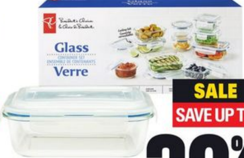
PC® GLASS FOOD STORAGE CONTAINERS SELECTED VARIETIES 21070296_EA/21339856_EA