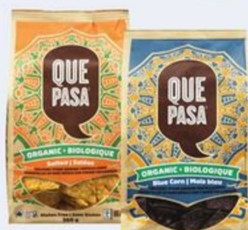
QUE PASA TORTILLA CHIPS SELECTED VARIETIES 300/350 G 21031315_EA/21031316_EA