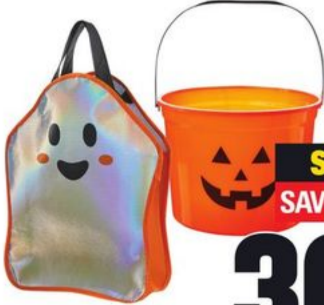
HALLOWEEN BAGS & PAILS SELECTED VARIETIES 21496809_EA/21576468_EA