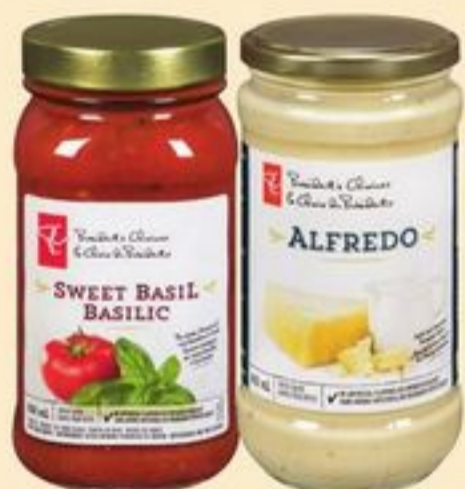
PC ® PASTA SAUCE SELECTED VARIETIES 410/650 ML 20131344009_EA 20320838001_EA