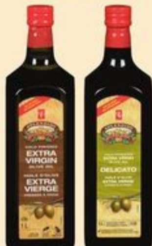
PC ® SPLENDIDO ® COLD-PRESSED OR COLD-EXTRACTED DELICATO EXTRA VIRGIN OLIVE OIL 1 L 20081865_EA 21401612_EA