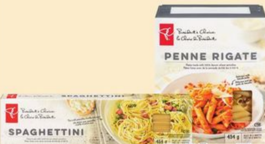
PC ® PASTA SELECTED VARIETIES 454 G 21001578_EA/21001588_EA