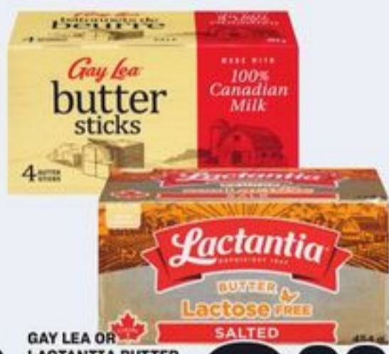
GAY LEA OR LACTANTIA BUTTER STICKS OR LACTANTIA LACTOSE FREE BUTTER SELECTED VARIETIES 454 G 20148873001_EA 21601669_EA