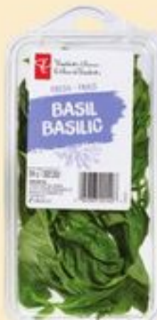
PC ® BASIL, BAY LEAF, SAGE, ROSEMARY OR OREGANO PRODUCT OF COLUMBIA, MEXICO, ECUADOR 28 G 21184798_EA/21212481_EA