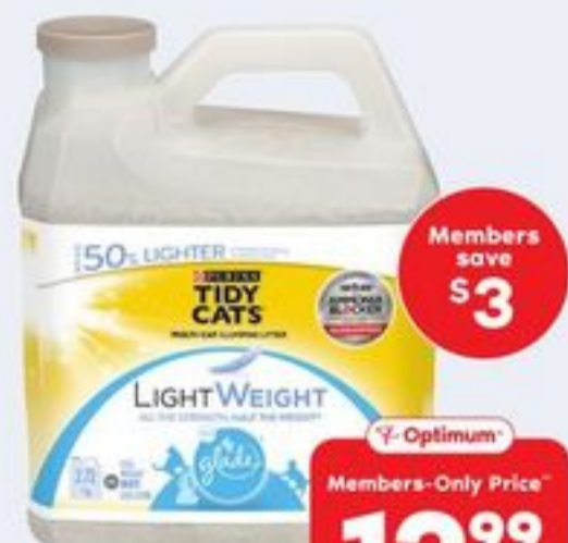
TIDY CATS LITTER SELECTED VARIETIES 2.72 KG 21206503_EA

Members save $3 12 99 Members-Only Price™ Non-members 15 99