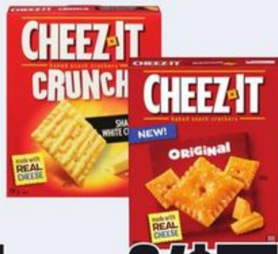
CHEEZ-IT CRACKERS SELECTED VARIETIES 191/200 G 21214559_EA 21214560_EA