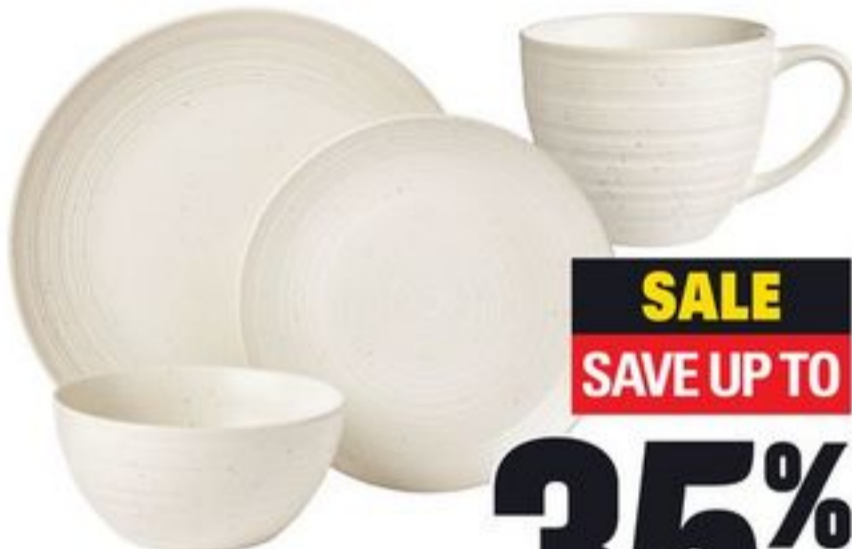
PC® DINNERWARE, DRINKWARE OR SERVEWARE SELECTED VARIETIES 20155343_EA/20748408_EA