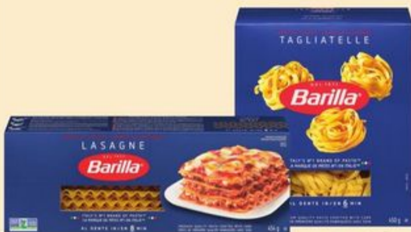
BARILLA LASAGNA 454 G OR NESTED PASTA 450 G SELECTED VARIETIES 20902949_EA/21531693_EA