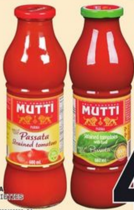
MUTTI PASSATA SELECTED VARIETIES 690 ML 20288490001_EA/20288490002_EA