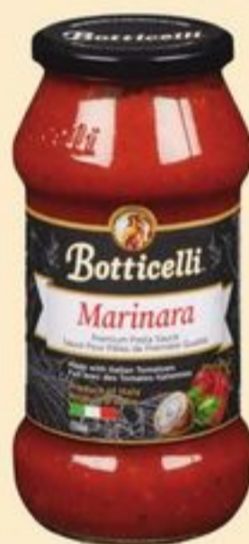
BOTTICELLI PASTA SAUCE SELECTED VARIETIES 370/710 ML 21544485_EA