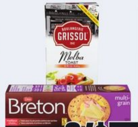
DARE BRETON OR VINTA CRACKERS SELECTED VARIETIES 132/225 G 20313040001_EA 21520685_EA