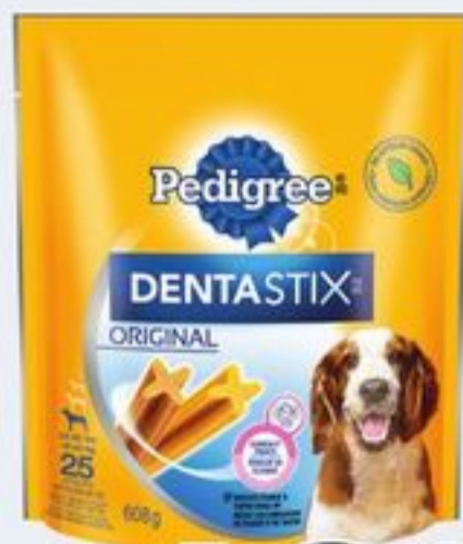
PEDIGREE DENTASTIX TREATS FOR DOGS SELECTED VARIETIES 100 G-1.9 KG 21081180_EA