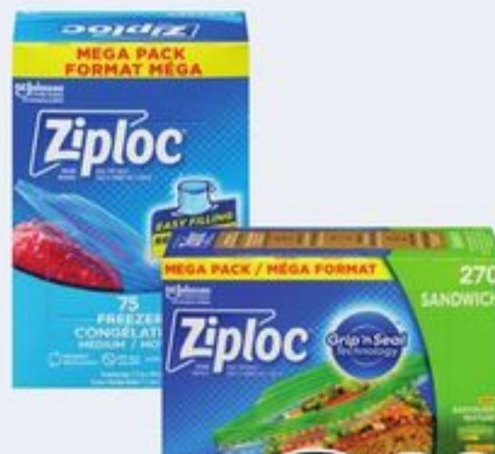
ZIPLOC MEGA PACKS SELECTED VARIETIES 75-270'S 21196101_EA/21196100_EA