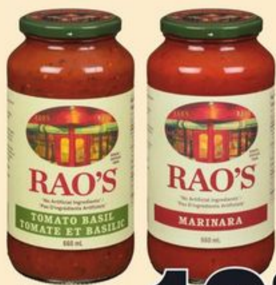
RAO'S PASTA SAUCE SELECTED VARIETIES 660 ML 20086654004_EA/20086654001_EA