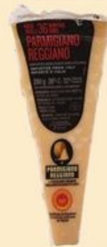
PC ® BLACK LABEL PARMIGIANO REGGIANO CHEESE PRODUCT OF ITALY AGED 36 MONTHS 200 G 20626019_EA