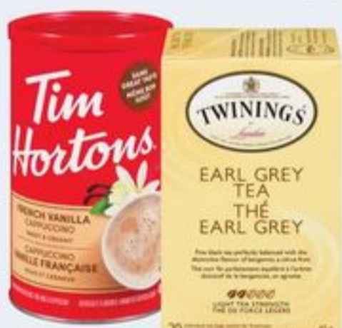
TWINING'S HERBAL TEA 20'S OR TIM HORTON'S HOT CHOCOLATE 500 G OR CAPPUCCINO FRENCH VANILLA, DOUBLE DOUBLE OR MOCHA 8'S SELECTED VARIETIES 20149985_EA/20308033001_EA