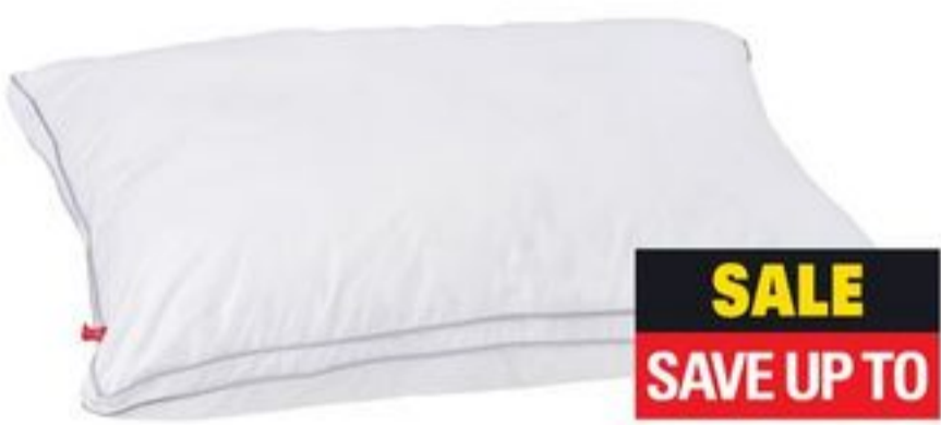
PC® PILLOWS SELECTED VARIETIES 21220214_EA