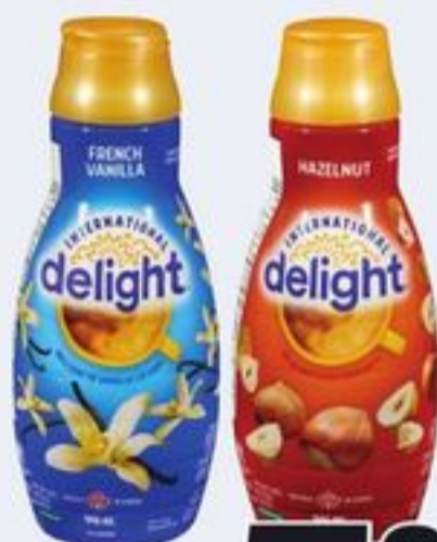
INTERNATIONAL DELIGHT COFFEE WHITENER OR COLD FOAM SELECTED VARIETIES 396-946 ML 20895480002_EA/20895480003_EA