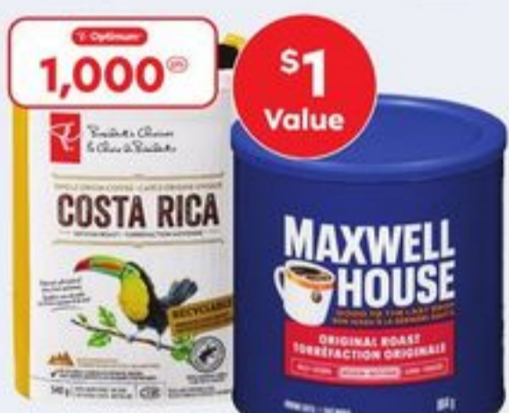
PC® WHOLE BEAN, ROAST OR GROUND 340 G OR MAXWELL HOUSE GROUND COFFEE 631-900 G SELECTED VARIETIES 21380541_EA/21606882_EA