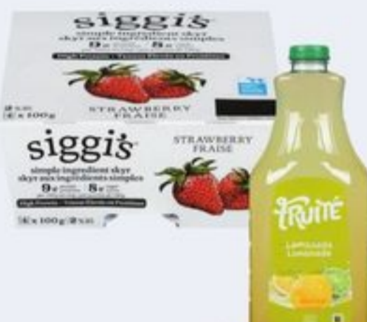
SIGGIS YOGURT 4X100 G OR FRUITÉ DRINK 1.54 L SELECTED VARIETIES 21589525_EA/21595744_EA