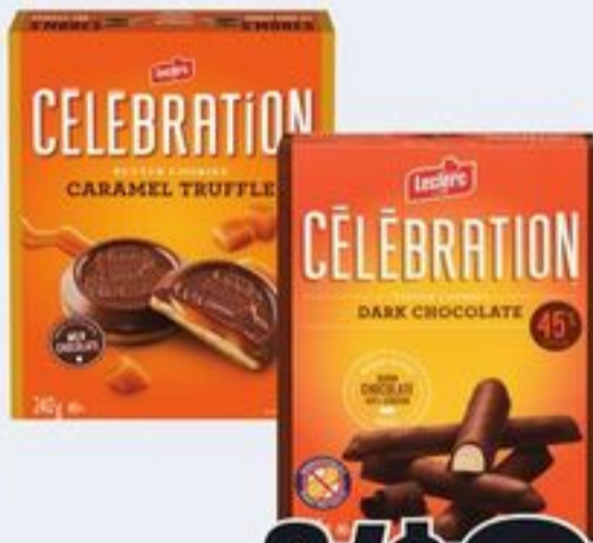
LECLERC CÉLÉBRATION COOKIES SELECTED VARIETIES 240 G 20853797001_EA 20965370_EA