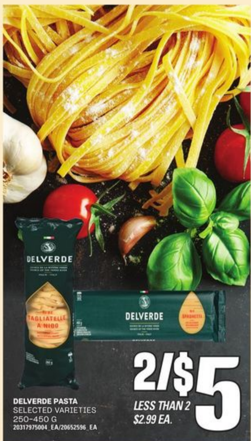
DELVERDE PASTA SELECTED VARIETIES 250-450 G 20317975004_EA/20652596_EA