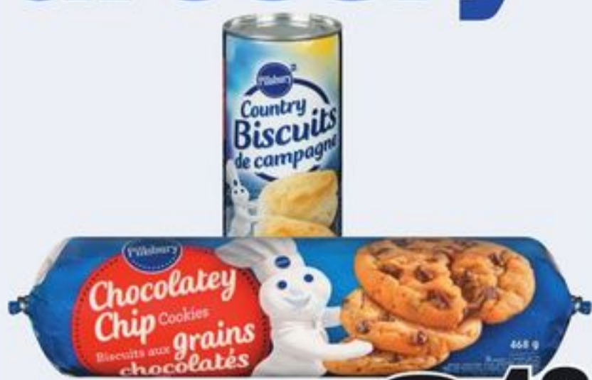
PILLSBURY READY TO BAKE CHUB COOKIE, ROLLS, CURST OR BISCUITS SELECTED VARIETIES 318-468 G 20317832003_EA/20318034001_EA