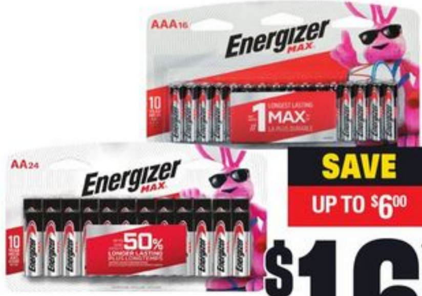
ENERGIZER MAX AA24, AAA16 OR 9V6 BATTERIES SELECTED VARIETIES 21026466_EA/21062566_EA