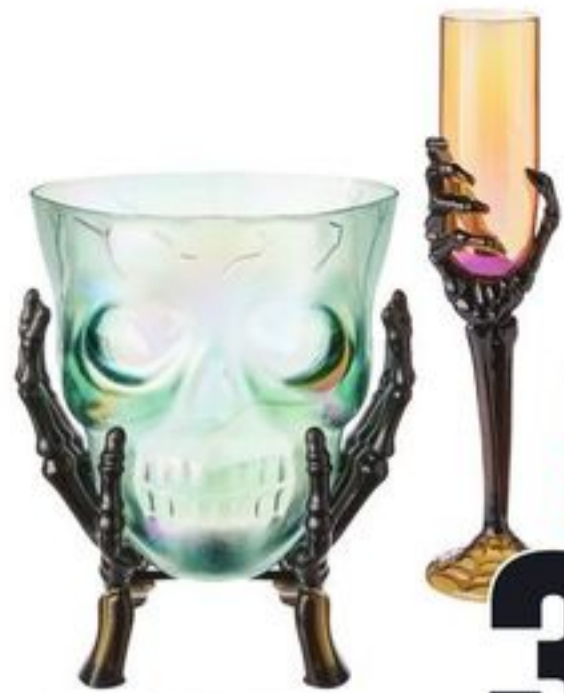
HALLOWEEN SERVEWARE SELECTED VARIETIES 21498419_EA/21498356_EA