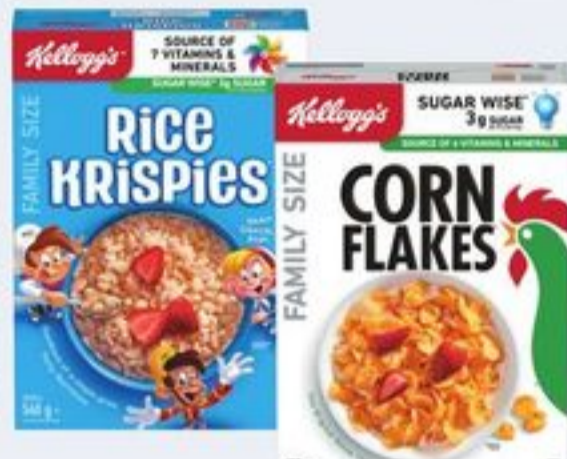
KELLOGG'S FAMILY SIZE CEREAL SELECTED VARIETIES 480-650 G 21449784_EA/21450811_EA