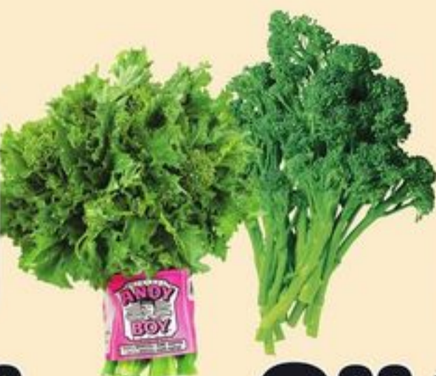
BROCCOLINI OR RAPINI PRODUCT OF USA EACH 20154907_EA/20048070001_EA