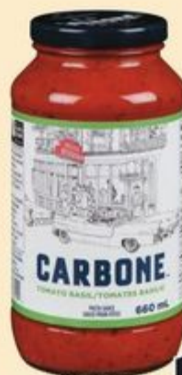
CARBONE PASTA SAUCE SELECTED VARIETIES 660 ML 21495459_EA